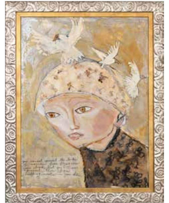
left: Quiet the Voice in My Head 24 x 18 in above: Building Nests in Your Hair 24 x 20 in

"Cherish all I see, feel, touch, taste, smell and experience ...for it is all a gift ...the mess and the goodness."