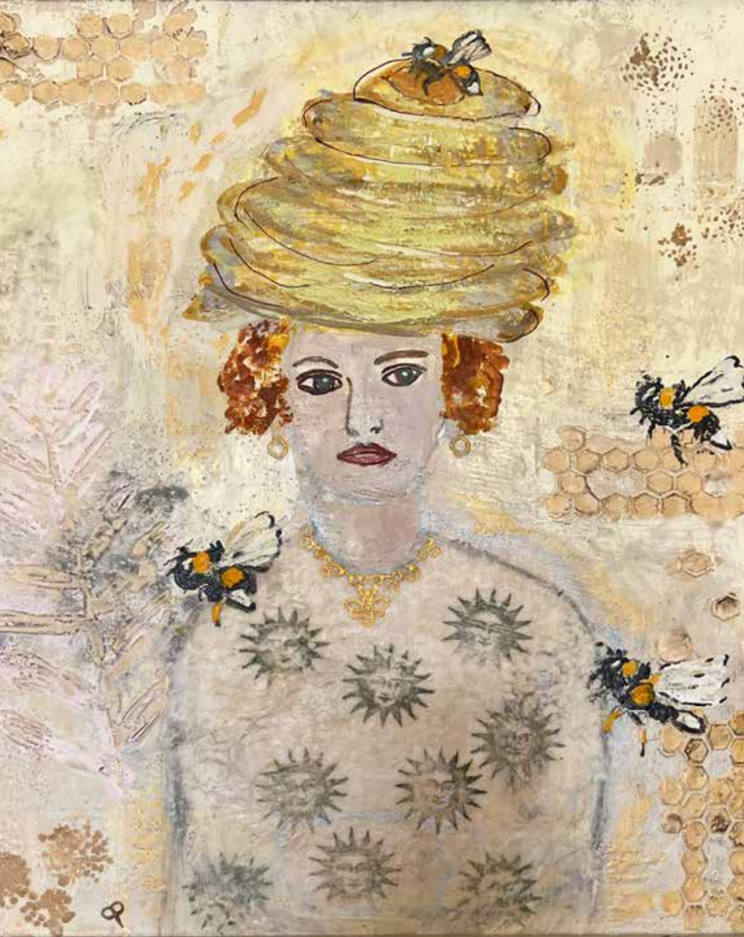
left: All the Buzz 24 x 20 in right: Hive 2