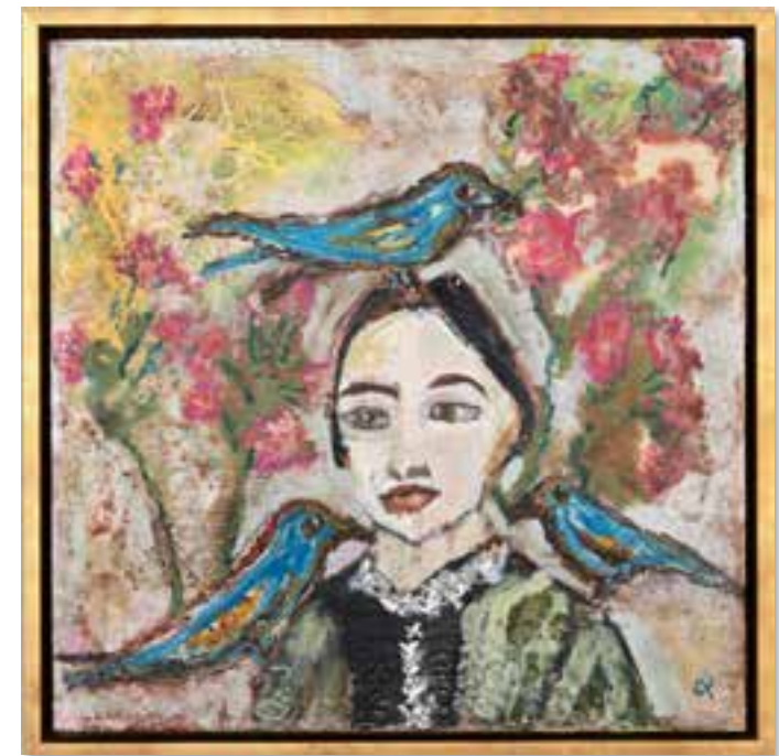
above: Lady of the Blue Birds 18 x 18 in