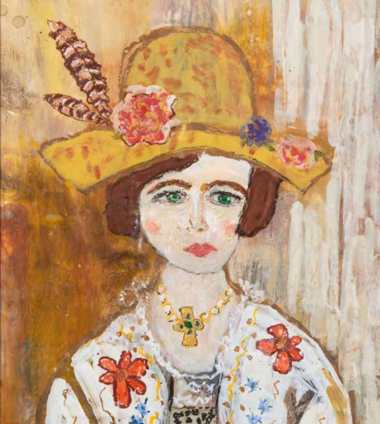
left: Lady of the Suffrage Movement 24 x 18 in