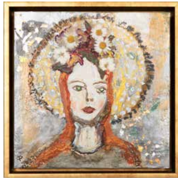
left: Maasi Woman 22 x 22 in

yearn to pass on to the viewers of my craft. I wish to express, in words first, my ideas so the observer sees the meaning behind the painting. My paintings represent a calling of the texture of life and emotions portrayed thru my use of animals, birds, the natural world of land and sea, and strong women.