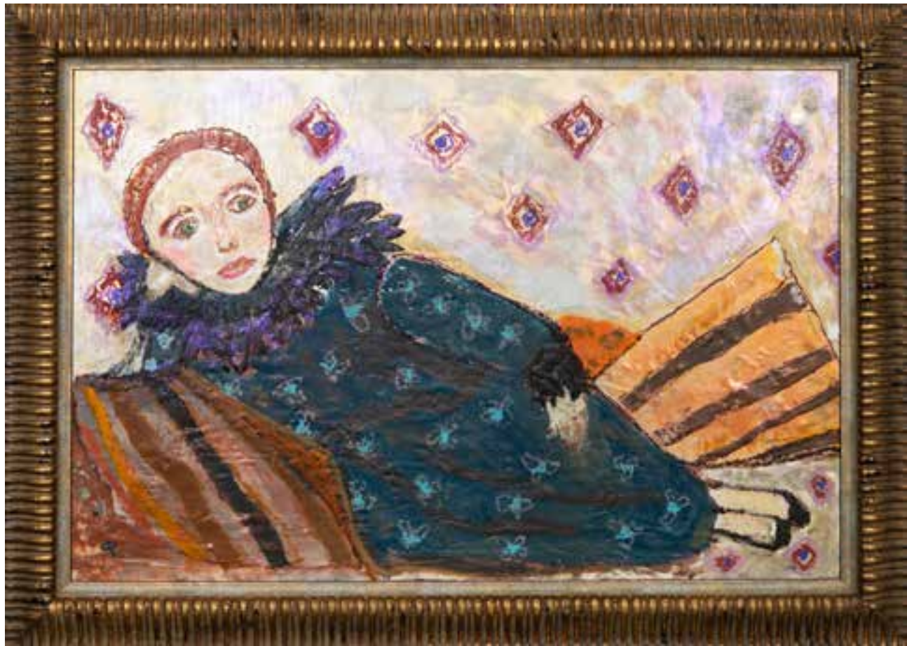
above: Reclining Afternoon 36 x 24 in - Framed lower left: Building Nests in Your Hair 24 x 20 in lower right: Lady of the Flowers 18 x 18 in right: The Lady of the Flowers Commission 36 x 24 in