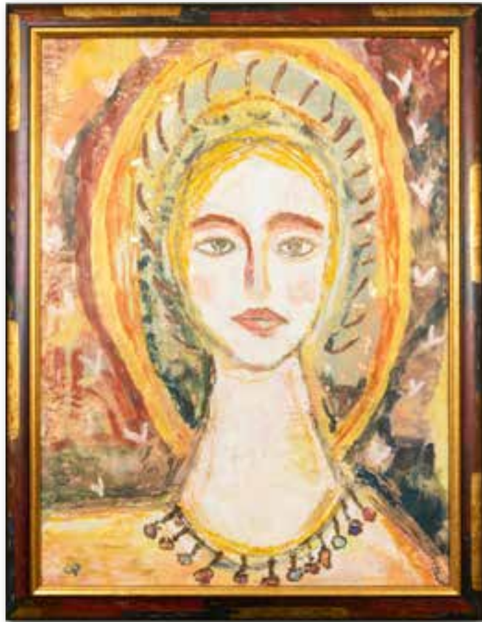
right: Woman with Wings