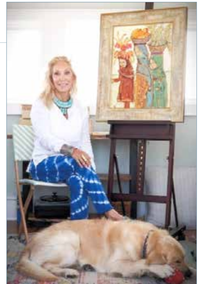
left: Indian Maidens Heading to Market 24 x 18 in