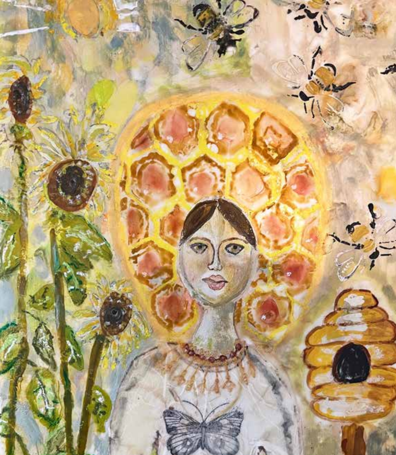
left: The Queen of the Hive 24 x 18 in right: Spread Your Wings 28 x 22 in