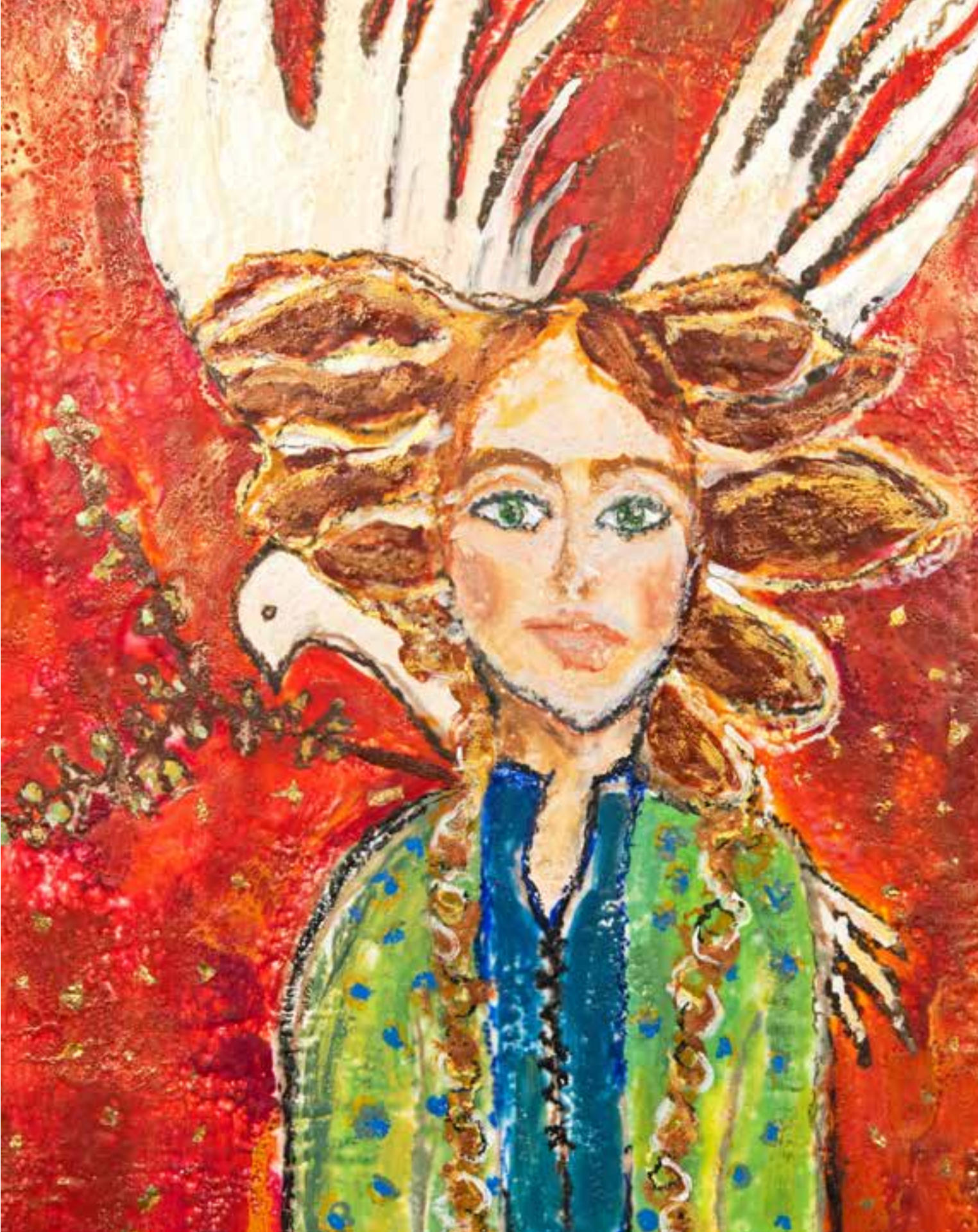
left: Extending the Olive Branch of Forgiveness and Peace 36 x 24 in right: Maasai Warrior 24 x 18 in